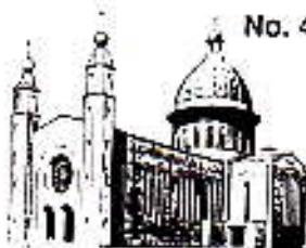
CHURCH OF THE HOLY SPIRIT DENWYD CROSS, CORK