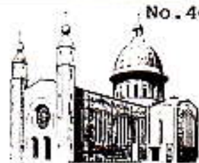
CHURCH OF THE HOLY SPIRIT, 15 BENEVA CROSS, CO. RM