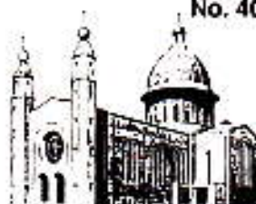
CHURCH OF THE HOLY SPIRIT DEWENYS CROSS, CORK