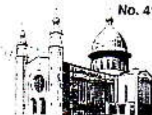
CHURCH OF THE HOLY SPIRIT, DENEHYS CROSS, COBK.