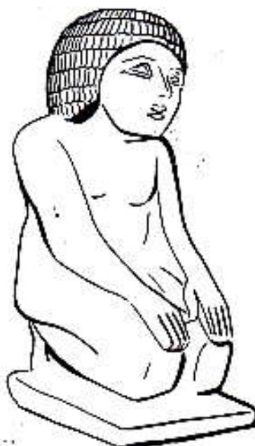
Egyptian Granite figure, h. 39cm (2850-2650 BC) Cairo Museum.

The desire to be permitted to sit or live in the Temple expresses the longing for an intimate relationship with God.