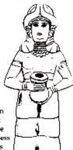
Limestone statue from 18th c BC with fountain vessel.

The suppliant of Psalm 73 is wearied by temptations and troubled by oppressive doubts. Unscrupulous, greedy persons have become the objects of his wonderment and envy. But in the temple he comes to the realization that they stand on shaky ground. What really liberates him is not the knowledge that "sin does not pay," but the experience of the "nearness of God" (v 28). Only that is a sure defence against despair. This nearness means "life". With God is the fountain of life. Being with God in faithfulness and love is the one thing necessary.