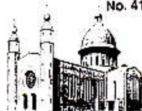
CHURCH OF THE HOLY SPIRIT BALLINEASPAIG, CO. CARL