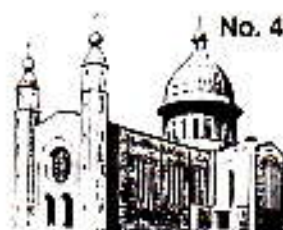
CHURCH OF THE HOLY SPIRIT DENWYNS CROSS, CO. DK