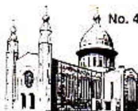
CHURCH OF THE HOLY SPIRIT, DEWENTON CROSS, CO. DUB.