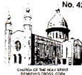
CHURCH OF THE HOLY SPIRIT DENMEYS CROSS CORK