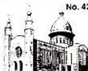
CHURCH OF THE HOLY SPIRIT, DEANERY'S OFFICE, CO. DN.