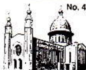
CHURCH OF THE HOLY SPIRIT, DENWYFFERDSS, CO. DK.