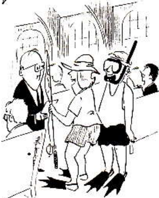
"COULD YOU GIVE US SEATS IN THE BACK? WE'RE LEAVING FOR THE BEACH RIGHT AFTER THE SERVICE"