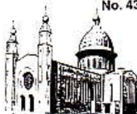
CHURCH OF THE HOLY SPIRIT DEINNEY'S CROSS, CORK