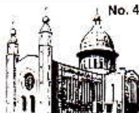
CHURCH OF THE HOLY SPIRIT, BALLINACORNEY, DUBLIN