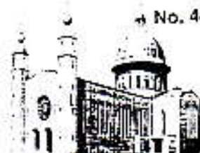
CHURCH OF THE HOLY SPIRIT DEANEVON CROSS, CO. RM