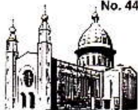
CHURCH OF THE HOLY SPIRIT DENNEYS CROSS, COBK