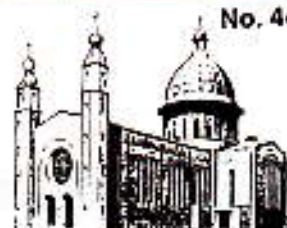
CHURCH OF THE HOLY SPIRIT, DENNEHY'S CROSS, CORK