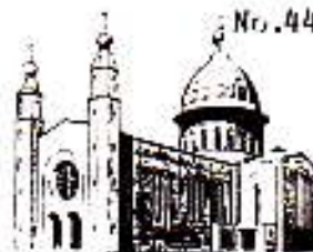
CHURCH OF THE HOLY SPIRIT DENEHYS CROSS, COBK