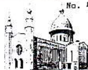
CHURCH OF THE HOLY SPIRIT OFFICERS CROSS CORN