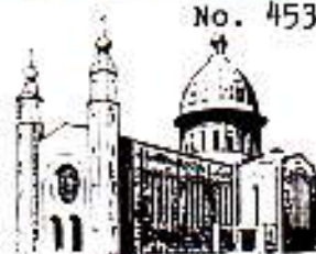
CHURCH OF THE HOLY SPIRIT DENEHYS CROSS, COBK