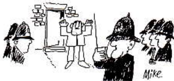
'The siege is over. He says he's decided to give himself up for Lent.'

Please continue to support the Centre, as you have done in the past.