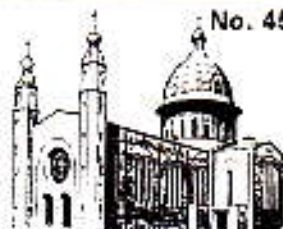
CHURCH OF THE HOLY SPIRIT, SEYMEN'S CROSS, DUBLIN