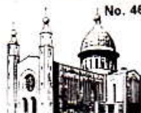
CHURCH OF THE HOLY SPIRIT BALLINEACROSS, CORK