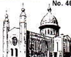
CHURCH OF THE HOLY SPIRIT 19 BERNYS CROSS COB