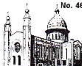
CHURCH OF THE HOLY SPIRIT DENMEHYD CROSS, COFFK