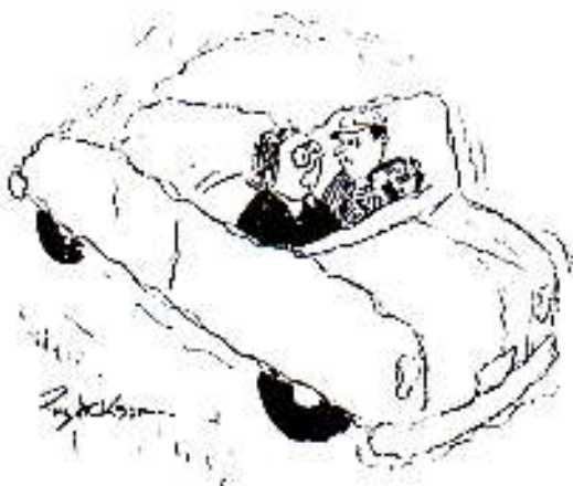
"WHY DO WE PRAY, GOD, KEEP THIS OLD CAR GOING? LET'S JUST PRAY FOR A NEW CAR."