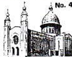
CHURCH OF THE HOLY SPIRIT DENMYS CROSS, COBK