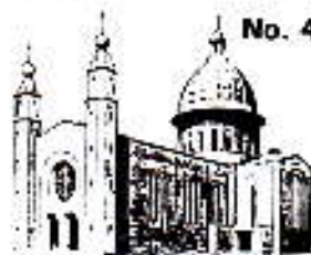
CHURCH OF THE HOLY SPIRIT CELESTINE'S CROSS, COBK