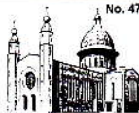
CHURCH OF THE HOLY SPIRIT, DENVER-VIS CHURCH, CO. IRE.