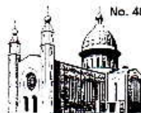
CHURCH OF THE HOLY SPIRIT DEVEREUX CROSS, CORK