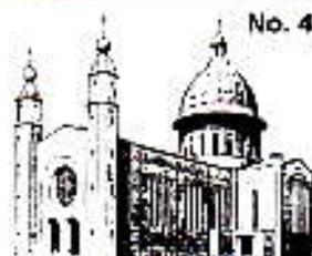
CHURCH OF THE HOLY SPIRIT DENMEY'S CROSS, CO. DM.