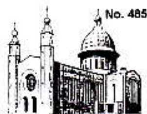
CHURCH OF THE HOLY SPIRIT OF MARSH CROSS CORK