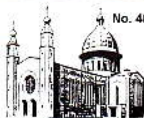
CHURCH OF THE HOLY SPIRIT, DENMEYS CROSS, CO. DK