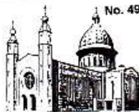
CHURCH OF THE HOLY SPIRIT, DENMEYS CROSS, DORK