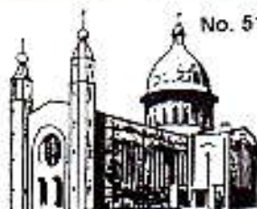
CHURCH OF THE HOLY SPIRIT DENNEHY'S CROSS, CO. CK.