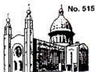
CHURCH OF THE HOLY SPIRIT DENNEWY'S CROSS, CORK