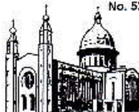
CHURCH OF THE HOLY SPIRIT DENNEHY'S CROSS, CORK