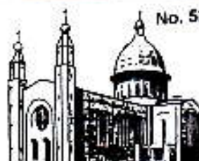
CHURCH OF THE HOLY SPIRIT DENNEHY'S CROSS, COBK.