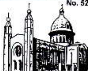
CHURCH OF THE HOLY SPIRIT DENNEHY'S CROSS, DORK