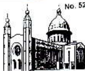
CHURCH OF THE HOLY SPIRIT DENNEHY'S CROSS, CO. DK