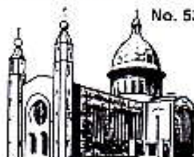
CHURCH OF THE HOLY SPIRIT DENNEHY'S CROSS, COBK.