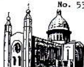
CHURCH OF THE HOLY SPIRIT DENNEHY'S CROSS, CO. DK.