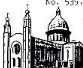
CHURCH OF THE HOLY SPIRIT DENNEHY'S CROSS, CO. K.