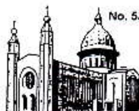
CHURCH OF THE HOLY SPIRIT DENBY'S CROSS, DORK