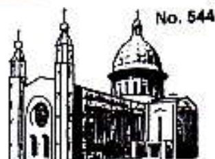
CHURCH OF THE HOLY SPIRIT DENNEHY'S CROSS, CORK