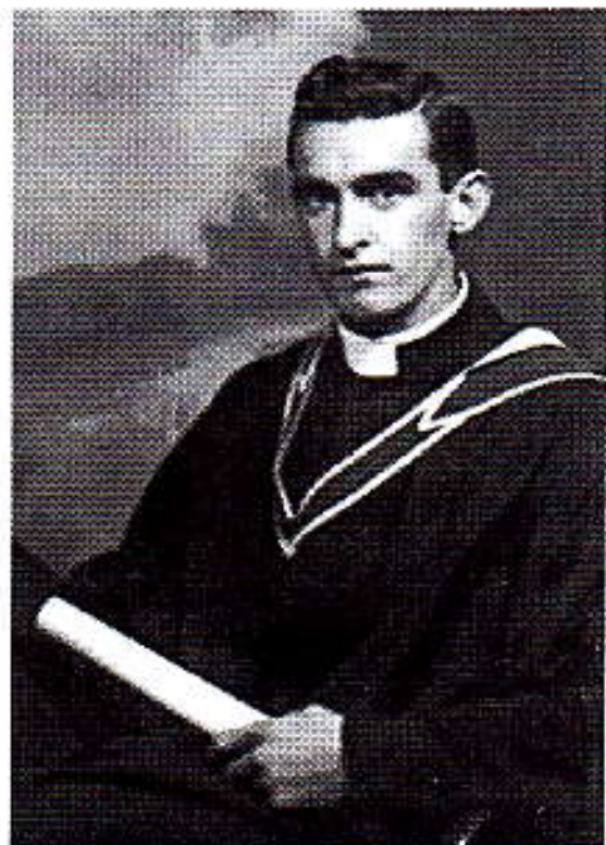
Degree Day in Maynooth