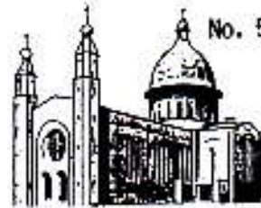
CHURCH OF THE HOLY SPIRIT DENNEHY'S CROSS, CORK