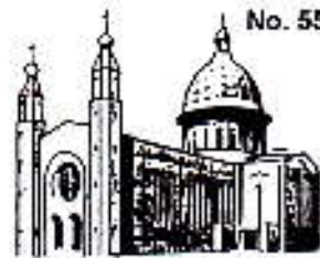
CHURCH OF THE HOLY SPIRIT DENNEY'S CROSS, COOK