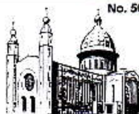
CHURCH OF THE HOLY SPIRIT DEANRY'S CROSS, CO. DK.