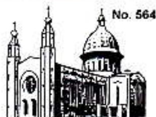
CHURCH OF THE HOLY SPIRIT DENEY'S CROSS, CORK