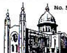
CHURCH OF THE HOLY SPIRIT DENNEHY'S CROSS, CO. WICK.