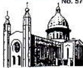
CHURCH OF THE HOLY SPIRIT DENNEY'S CROSS, CORK