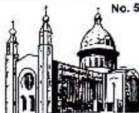
CHURCH OF THE HOLY SPIRIT DENNY'S CROSS, CORK